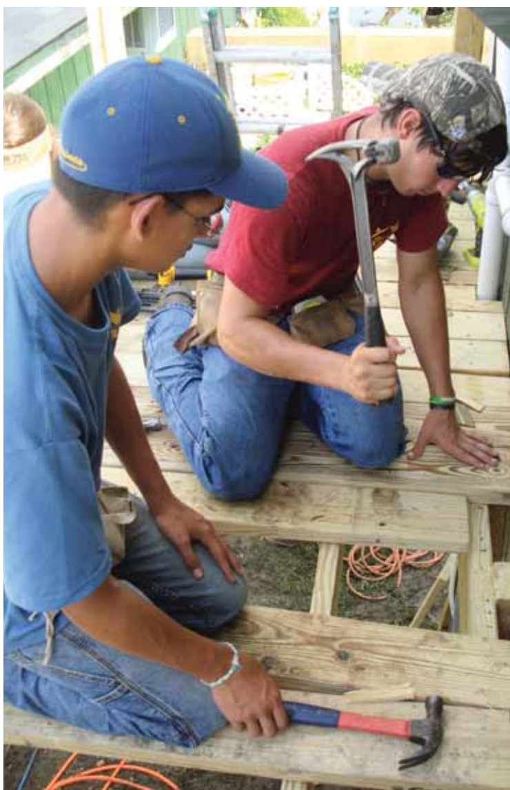
Learning a new skill while providing a service. Volunteers are still needed in South Louisiana. Above, youth repair a home damaged by Hurricane Gustav.