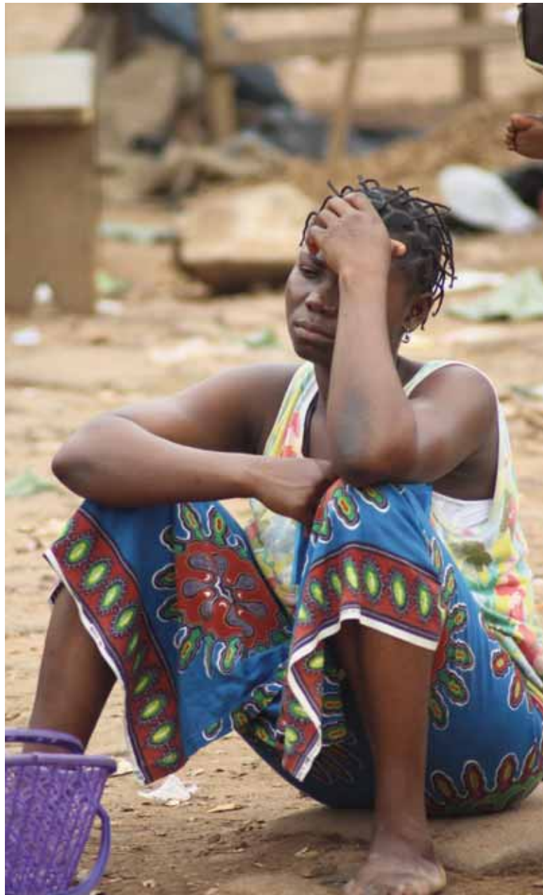
"Worth the Wait" is the title of this photo taken in Cote d'Ivoire. It was named best photo taken by an Annual Conference by the United Methodist Association of Communicators.

"The woman in the photograph embodied the desperation and dedication of the people of Cote d'Ivoire," Colvin said. "They desperately need a way to protect their children from a preventable disease, and they're dedicated enough to walk for miles or wait for hours to do so. She captured that."