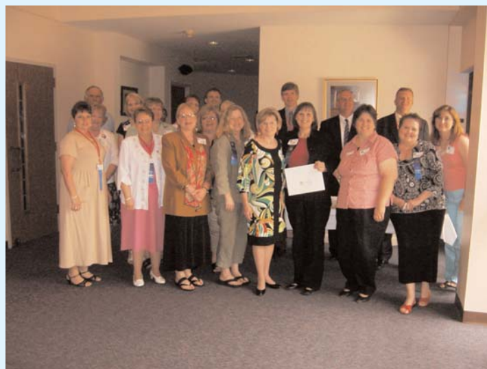
Twenty-seven Churches Receive the Five Stars of Excellence in Christian Education Award.

TCCEF is one of the largest and most active chapters of the