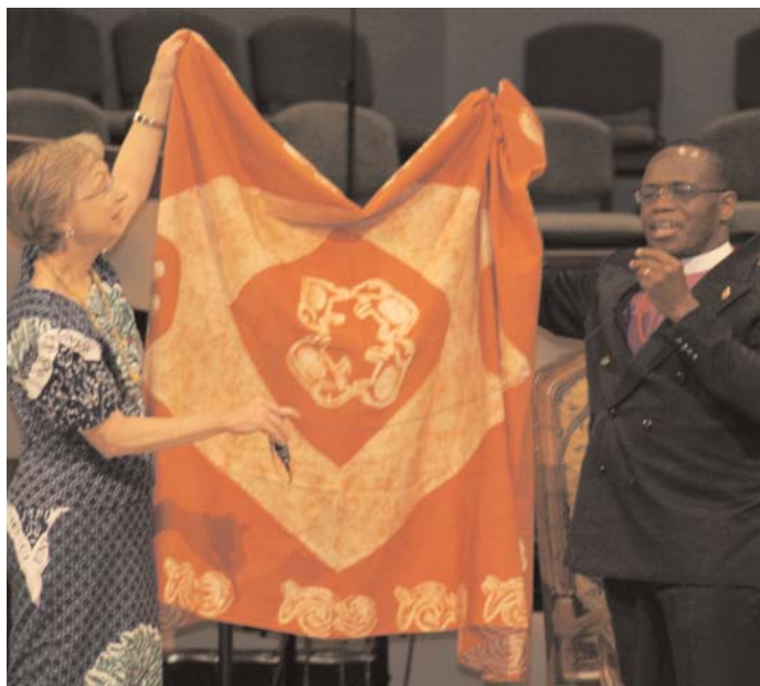
Bishop Benjamin Boni presents Bishop Janice Riggle Huie an African cloth representing the relationship between the Cote d'Ivoire and the Texas Annual Conferences. The fabric features an united circle of elephants, which are a symbol of strength in Cote d'Ivoire.

The Wednesday morning business session included an affirmation ceremony led by Bishop Janice Riggle Huie and a Zimbabwean blessing for each district offered by Bishop Benjamin Boni of Cote d'Ivoire.