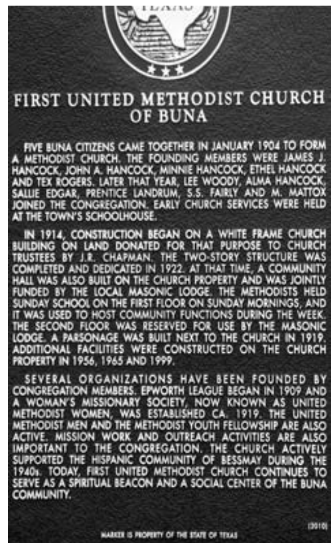
The marker honoring 107 years of ministry and service through Buna First UMC.

The last sentence on the marker holds true for First UMC Buna and echoes the hope and future spoken of in Jeremiah 29:11 – First UMC continues to serve as a spiritual beacon and a social center of the Buna community.