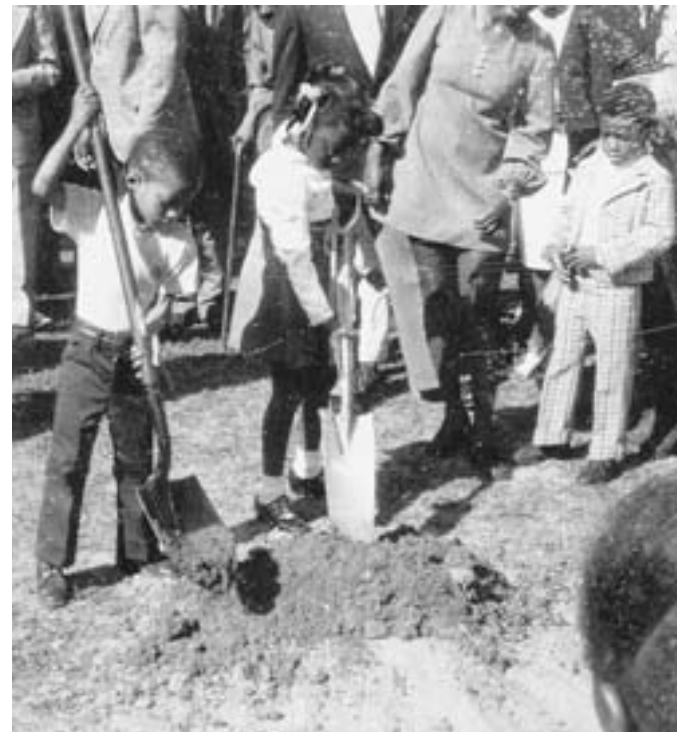
Children participate in the groundbreaking ceremony of St. Mark's at its present location, where members still strive to break new ground for God.

A member of the Central South District of the Texas Annual Conference, St. Mark's is a small, service-oriented congregation. Members have been active in Hurricane Recovery work; donated disaster relief health kits, flood buckets and baby layettes; supported Nothing But Nets; participated in the Texas Mission of Mercy dental project; hosted annual school supply drives; delivered meals through Interfaith Ministries, and the church is home to the Commission on Native American Ministries (CONAM) Third Sunday Fellowship.