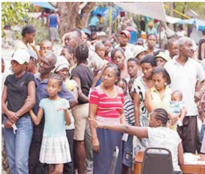
After the earthquake in January, patients wait for medical care at an outdoor clinic in Port-a-Prince.

All team members interested in volunteering in Haiti in the next year must register on-line at www.umrespond.org/Haiti . You will not be considered as a team member unless you register on this site.