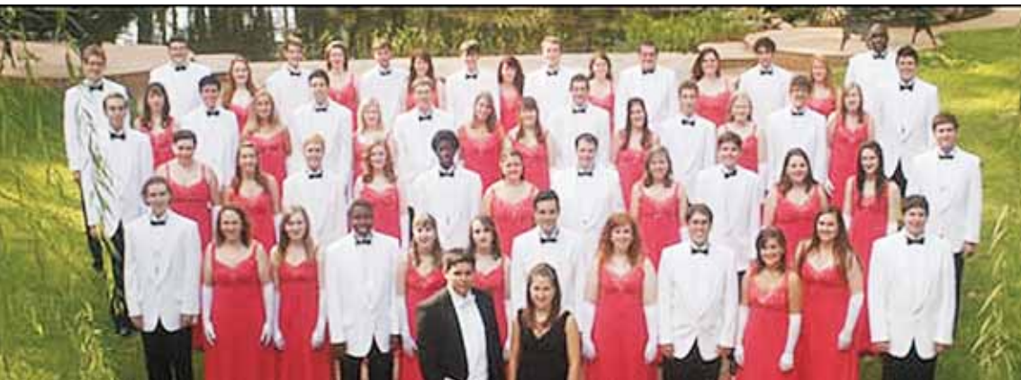
The Centenary College Choir

"America's Singing Ambassadors," the Centenary College Choir, will be in full voice as it presents a concert on Sunday, February 28, at 4 p.m. at John Wesley UMC in Houston.