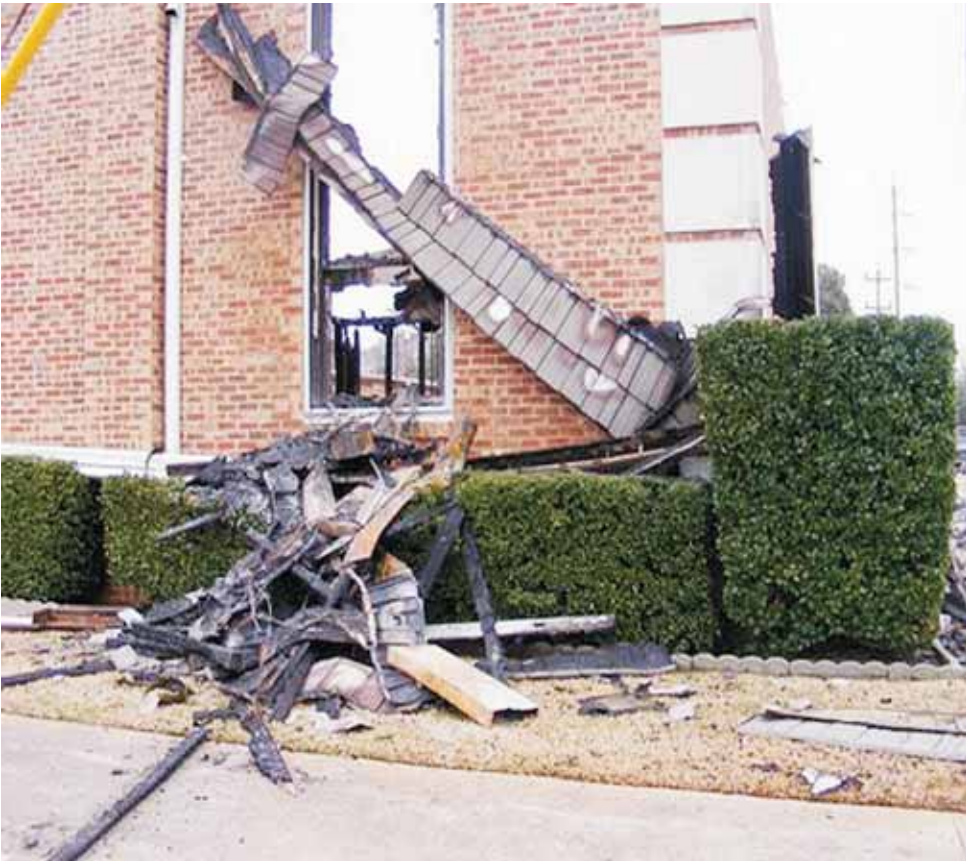
Hedges covered in debris remain untouched in the shadow of the shell of the church after the fire.