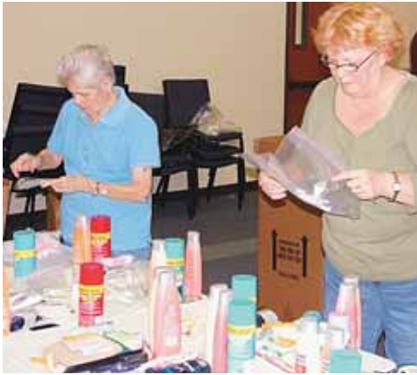
Volunteers gather supplies that will be used in the mobile medical unit funded and built by the church.

Cokesbury UMC, in partnership with Christian Alliance and UMCOR (United Methodist Committee on Relief) will be sending medical resources to the earthquake victims of Haiti.