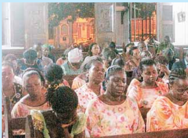
Members of the United Methodist Church of Plateau in Abidjan pray for the people of Haiti during worship.

Then the choir sang "on the ocean in dementia ... when there is no hope to arrive safe and sound, let Jesus Christ be your captain." The song was fol-