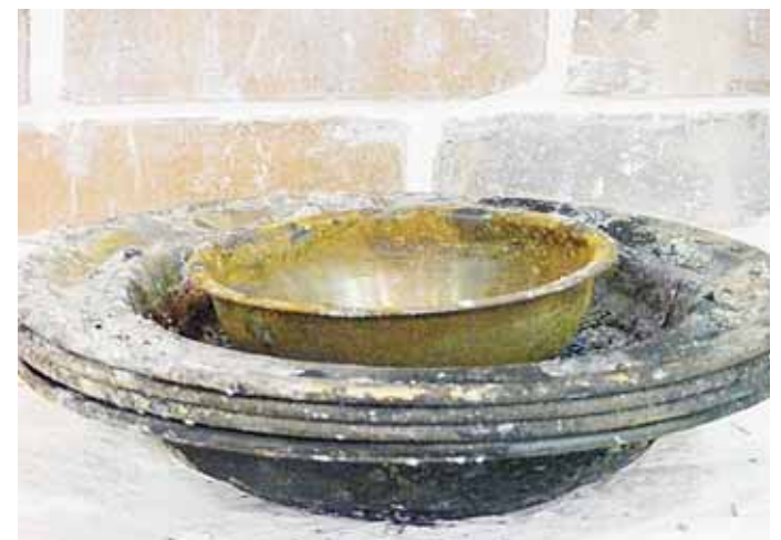
Brass offering plates recovered from the sanctuary ashes.