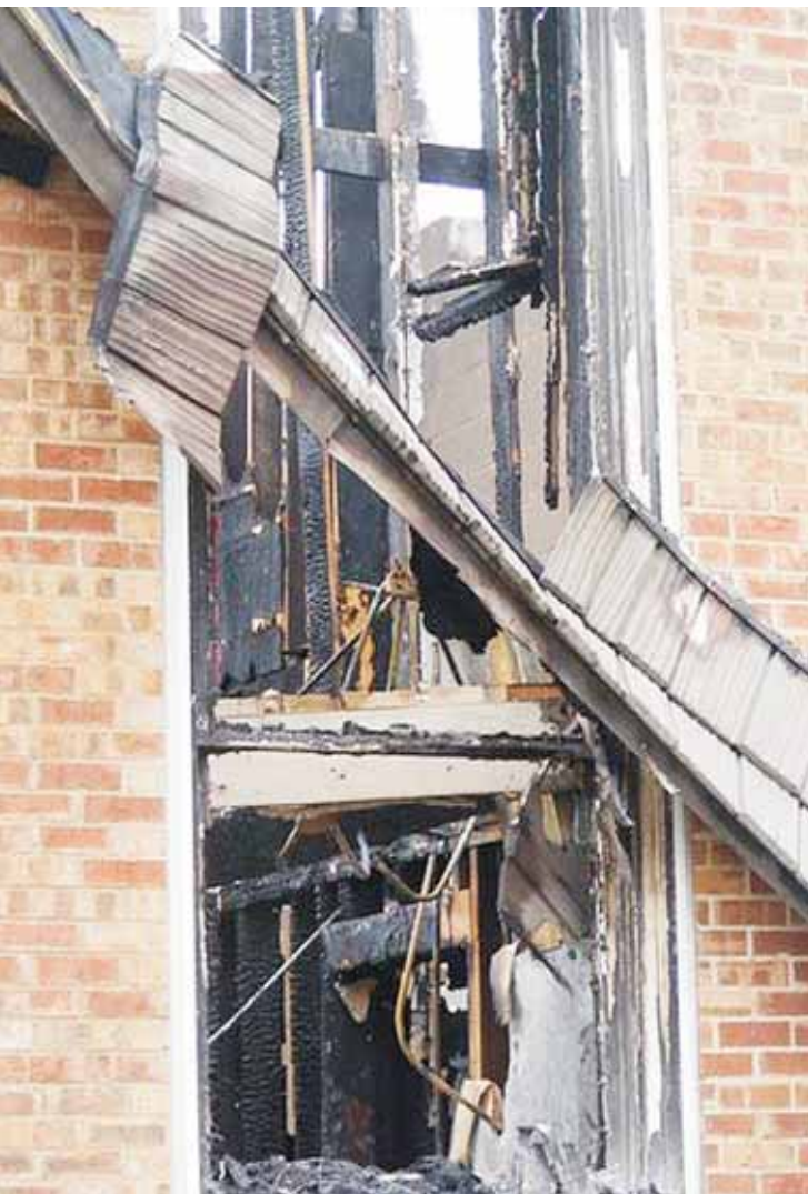
Bottom Left Photo: Fallen gutters replace stained glass windows, giving a view into the destroyed sanctuary.