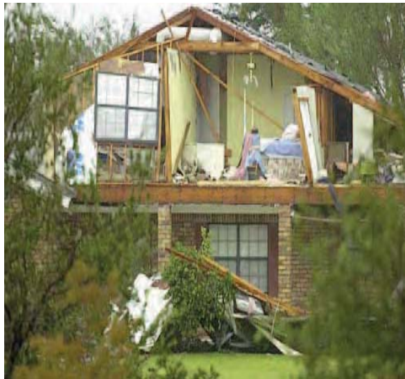
Southeast Texans still need help recovering from Hurricane Rita. The pictured home -- with its roof blown off in the storm -- illustrates Rita's wrath.

More registration information is available on the Partners in Mission web site at www.partnersinmission.org or by calling 713-521-9383 x316.