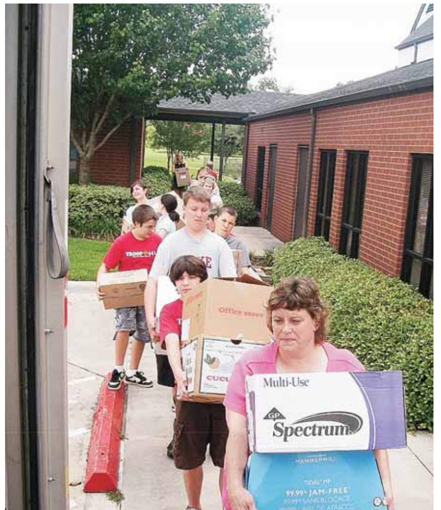
Volunteers fill a truck with aid for South Texas and Mexico.