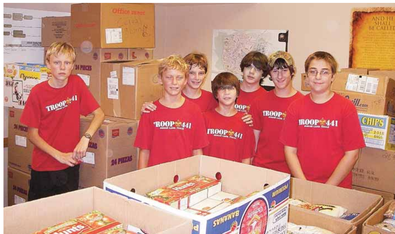
Boy Scout Troop 441 of Christ UMC Sugar Land assisted with the 15-minute speed load of trucks with storm relief supplies.