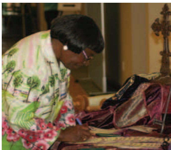
Top: Labyrinth workshops are planned for beginning and experienced labyrinth walkers. This labyrinth meditation took place at a Southeast District event commemorating Hurricane Rita.