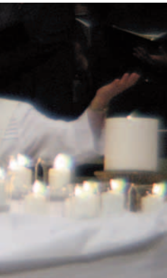
Conference 2007. Candles used to adorn the family. Altar design workshops are recommended

hold of Genesis and Revelation. This brief introduction may give you some ideas for helping new (or old, disenchanted) Christians take a deeper look at the Bible and its centerpiece.