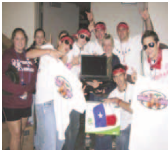
The youth ministry of Mission Bend UMC show off prizes won in the Amazing Bible Race contest held during Youth 2007 conference.