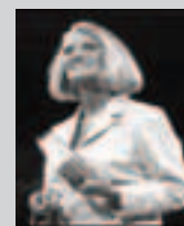
Anne G. Lotz

First Methodist is assisting in developing the Anne Graham Lotz, "I Saw the Lord" bible study. The study