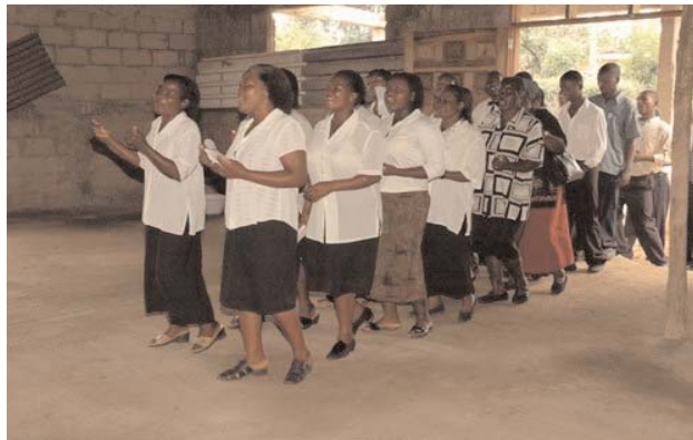
Members of Bento Navesse Church in Mozambique enter the sanctuary with praise and thanksgiving.

Two months have passed since nine churches officially