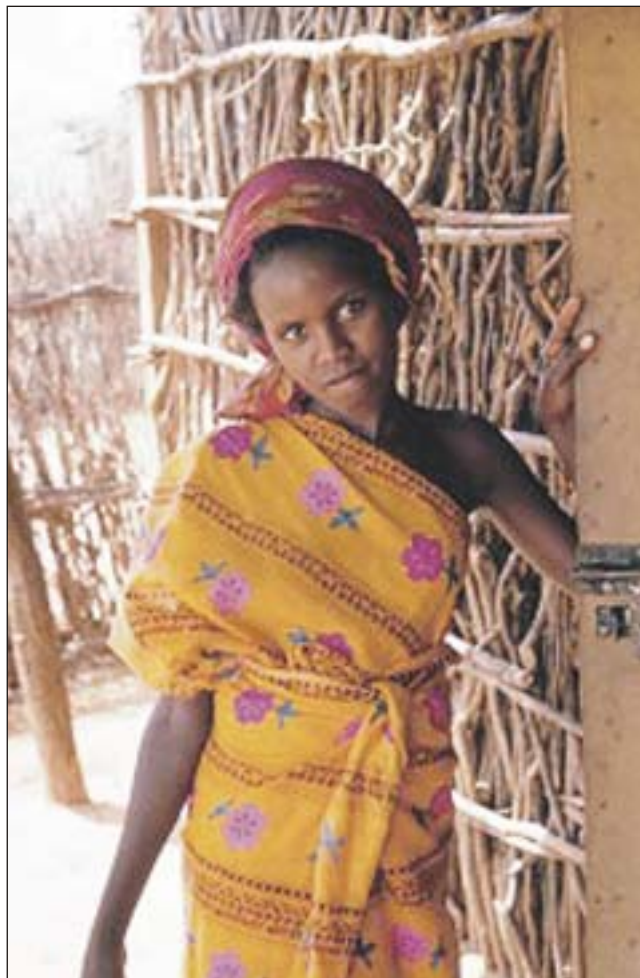
A young girl visits a health clinic in the Somali bush country.