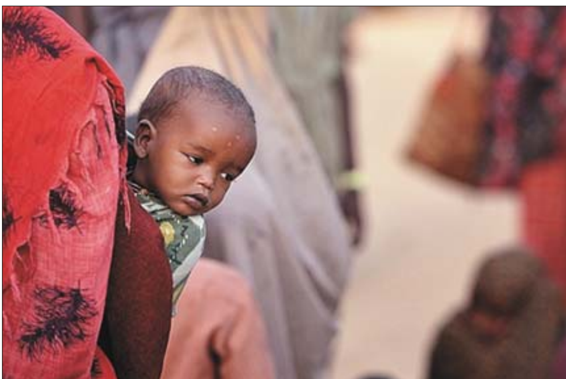
A Somali woman carries her child on her back as she waits to be processed into the Dogahaley section of the Dadaab Refugee Camp.