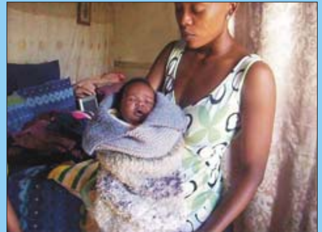
A mother cradles her child in one of the baby sacks created from the knitted squares of cloth.

together and work in a mission project at home. The response was overwhelming.