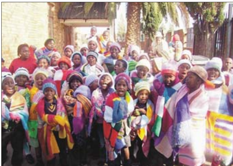
Appreciation for the work of the Knit-A-Square ministry at Clear Lake UMC is exhibited by the smiling happy faces of these children in one of the day care groups in South Africa.

After two months, I was impressed by God to approach the staff at my home church, Clear Lake UMC in Houston, Texas, to inquire whether I could begin a knitting ministry. With their support I began asking church knitters and crocheters to meet