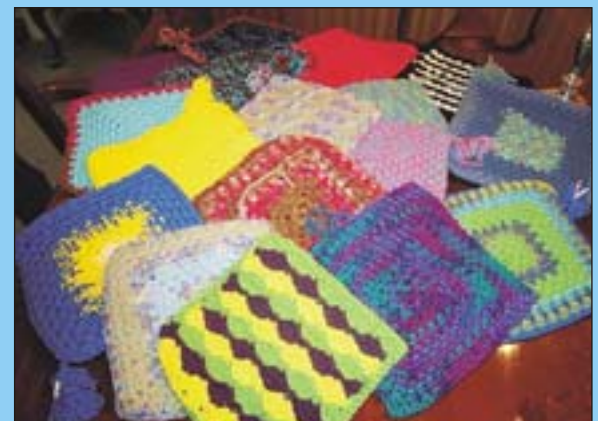
A photo of the cloth squares. The ministry at Clear Lake UMC has sent more than 2,000 pieces of cloth in a two year period.

At the Knit-a-Square website www.knit-a-square.com there is a Square Circle Forum if anyone is interested in starting this rewarding ministry. This month the website announced the charity is extending into Zimbabwe to send squares to a home where there are 130 orphans who need blankets. Truly God is blessing this endeavor as He has given so many of us the opportunity to show mercy to our neighbors who are on the other side of the world.