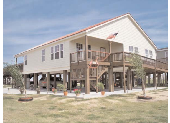
The newly reconstructed parsonage of Sabine Pass UMC. The original home was heavily damaged by Hurricane Rita.