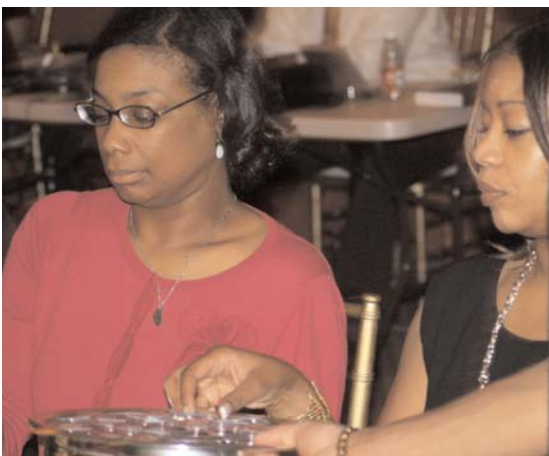
New World members receive new life in Christ, as they partake of the Holy Sacraments.