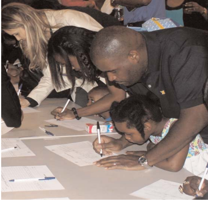
Signing this document officially identifies one as a founding member of this new Texas Annual Conference church.