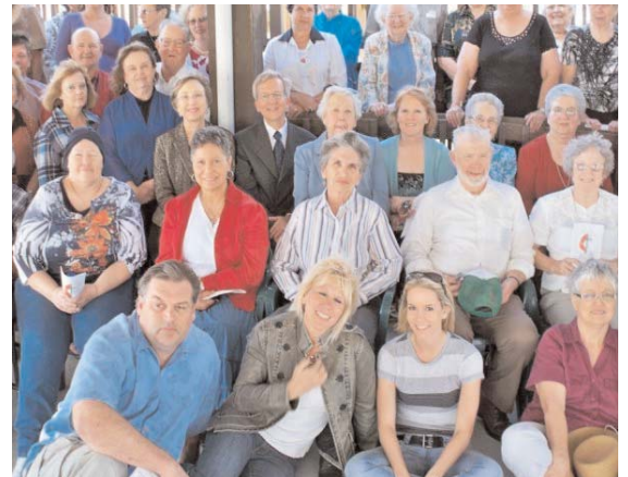
Members of the congregation and many of the workers, some from as far away as Maryville, Tennessee, were on hand for event.