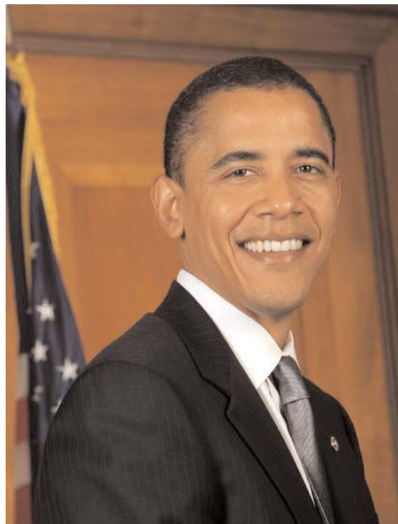
Senator Barack Obama President-Elect of the United States

Along with all the other bishops in The United Methodist Church, I have just signed my name in a Bible which will be given to the next president of the United States of American, Senator Barak Obama. A second Bible will be presented to his wife Michelle Obama. A letter of congratula-