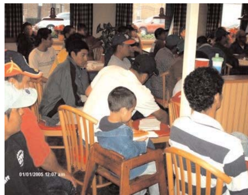
Top Right: The Food Pantry of Gethsemane UMC. The pantry is open to the public twice a month on Tuesday, 10 a.m to 2 p.m. and Thursday, 3-6 p.m.