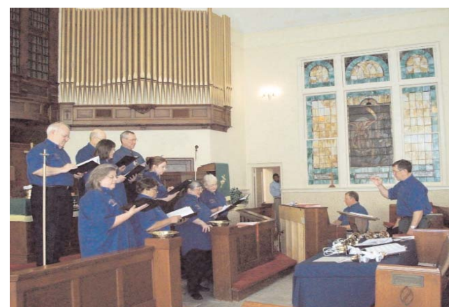
Top Photo: Member of the Chancel choir from FUMC Navasota prepare to sing.