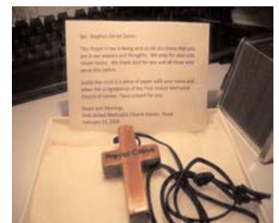
The prayer cross created by the Prayer Ministry of First UMC, Center, Texas.

Each Sunday service, the church will have a special prayer for the soldier. Then we mail the cross to them with a note in the box that thanks them for their service along with our prayers that this cross will keep them safe and give hope and comfort to their families.