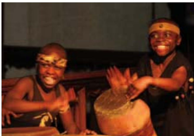
Drummers join in the praise celebration.

Many of the children have lost one or both parents through the devastation of war, famine and disease. Their voices