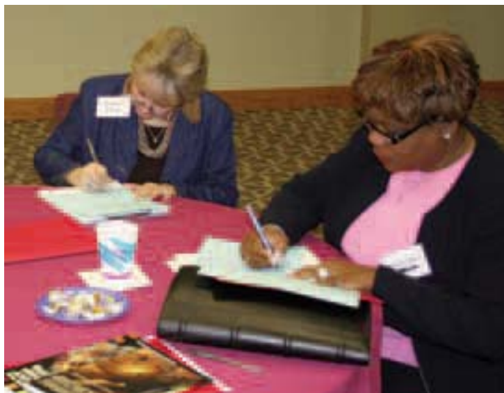
Pastors work together during the clergy group facilitator training.

In addition to the Covenant Clergy Professional Disciplines Groups created by the Center, clergy may choose to be in other existing or new peer groups. All groups must meet regularly to hold one another accountable; recognize a facilitator and membership list and share a written covenant of confidentiality.