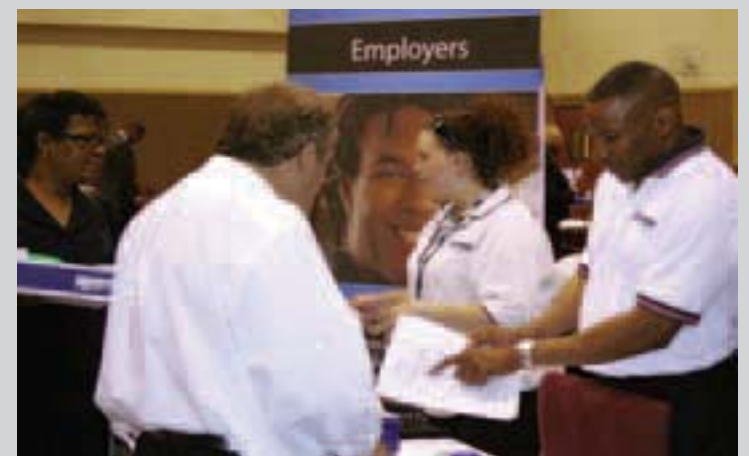
Connecting job searchers and community businesses was one of the primary focal points of the job fair.

and thought: If they had a few tips, they would have interviewed much better."