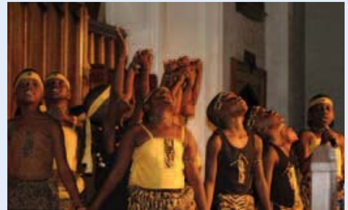
The African Children's Choir sings 'He's Got the Whole World In His Hands.'

Pilot. Teacher. Air traffic controller. Hairdresser.