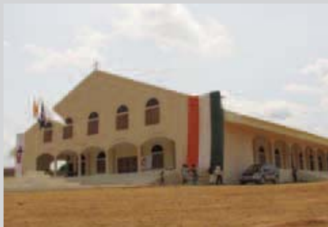
The Beth Shalom United Methodist Church building.

District of Adzopé. The consecration took place Sunday, April 22, during a special service held in the rural city of 5,000 inhabi-