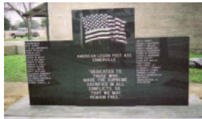
A photo of the monument honoring veterans from Somerville, Texas.