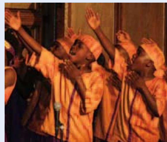
Choir members lift their hands and voices in praise.

Professional singer. Actress. Pastor. Those are just a few of the aspirations of the young singers who introduced themselves at St. Mark's UMC