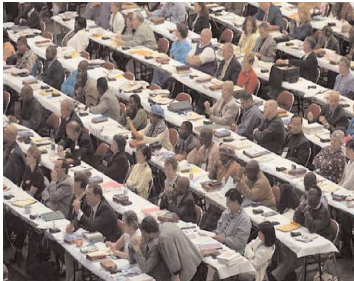
Delegates consider legislation during the United Methodist Church's 2004 General Conference in Pittsburgh. Petitions for considerations by the 2008 General Conference may be submitted until October 26.

Petitions may also be submitted through overnight carriers (Federal Express, UPS, DHL) to Gary Graves, Petitions Secretary, United Methodist General Conference, 302 N. Lafayette Street, Beaver Dam, KY 42320. They also may be sent by fax to: 270-274-4590 or by e-mail to petitions@umpublishing.org.