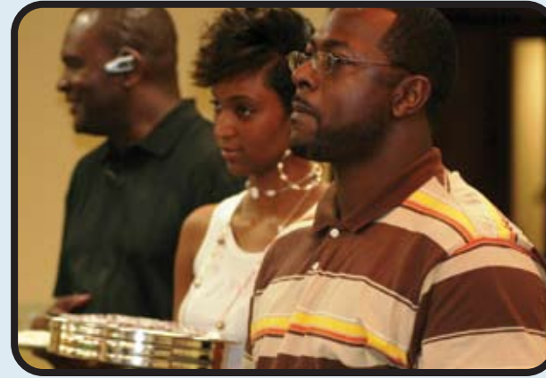
New Church In Action