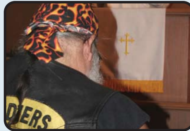
Transformation In Progress