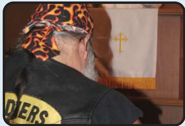
Transformation In Progress