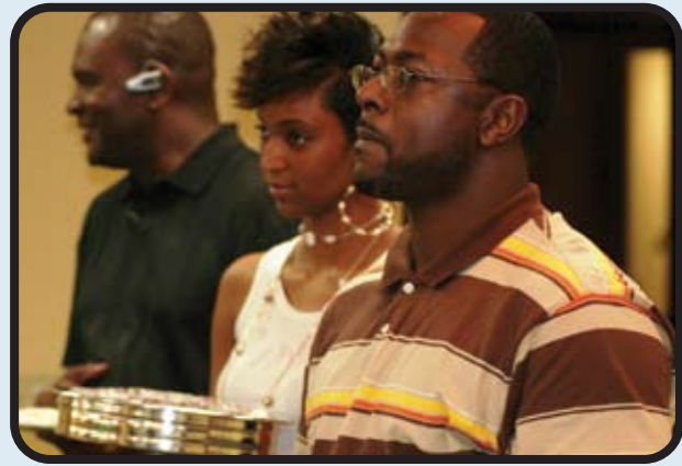
New Church In Action